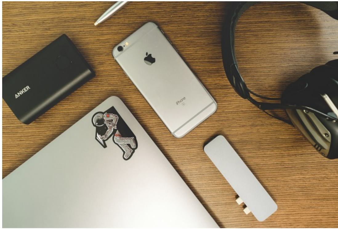
Photo Credit: Aditya Chinchure IG: @aditya.chinchure [Vancouver, BC]

Perfecting techniques to feature products in a way that attracts viewers to engage with a brand can take photographers a long way. It can also turn out to be quite an expensive and time-consuming task for even the most experienced photographer.