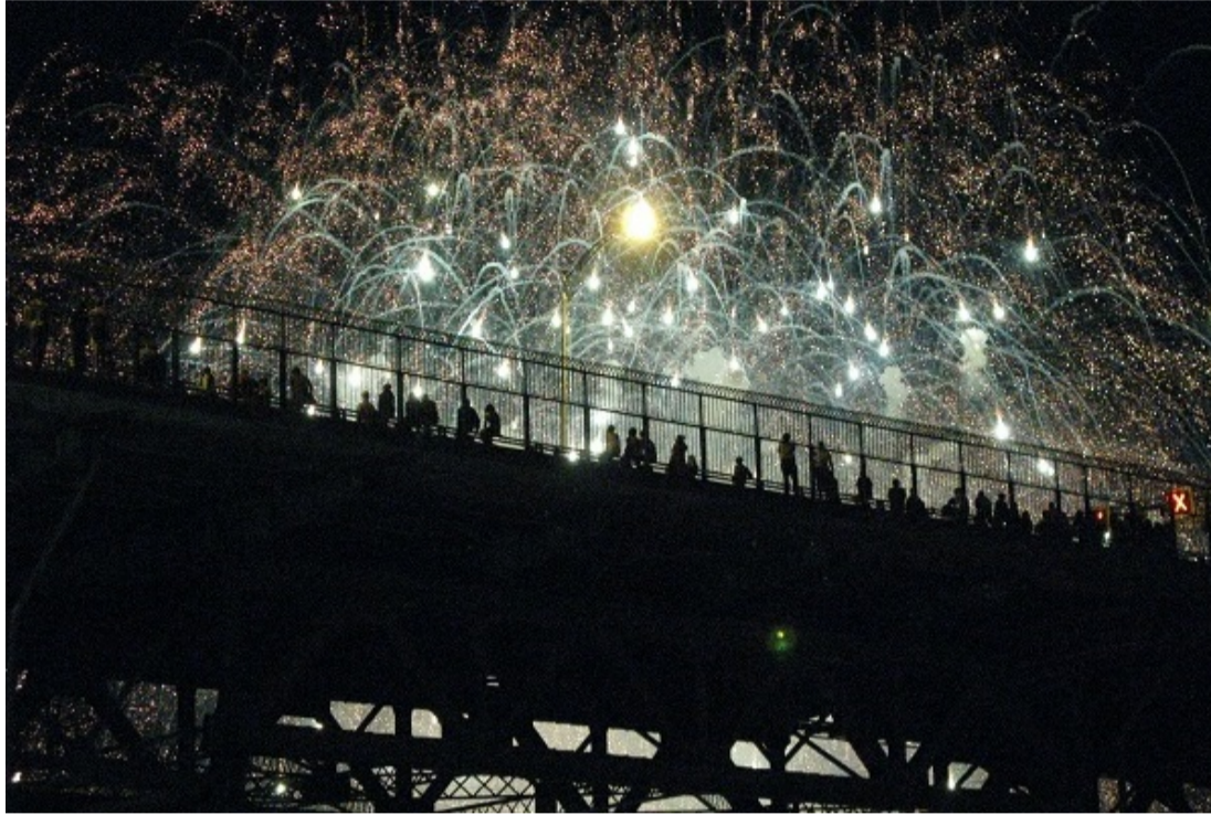
[Montreal, QC]